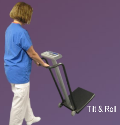
Tilt & Roll