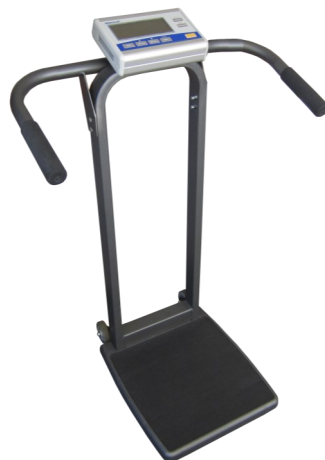
MX308CHR in handrail scale mode. (Converts in seconds.)